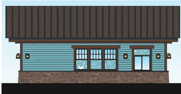
4 SOUTH ELEVATION 1/4" = 1'-0"