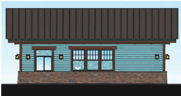
1 NORTH ELEVATION 1/4" = 1'-0"