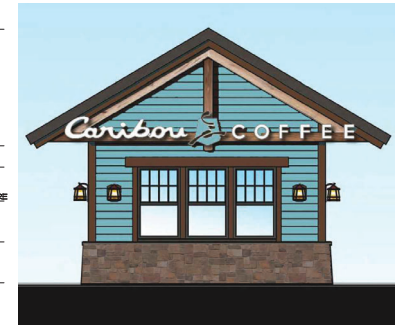
2 EAST ELEVATION 1/4" = 1'-0"