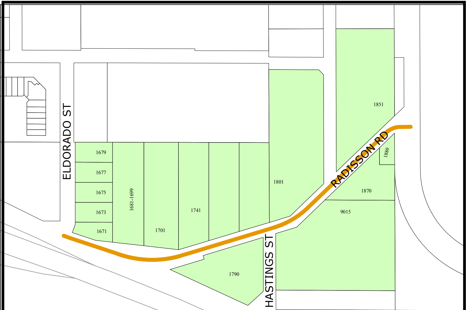
Exhibit 3 Assessment Map Project 13-24