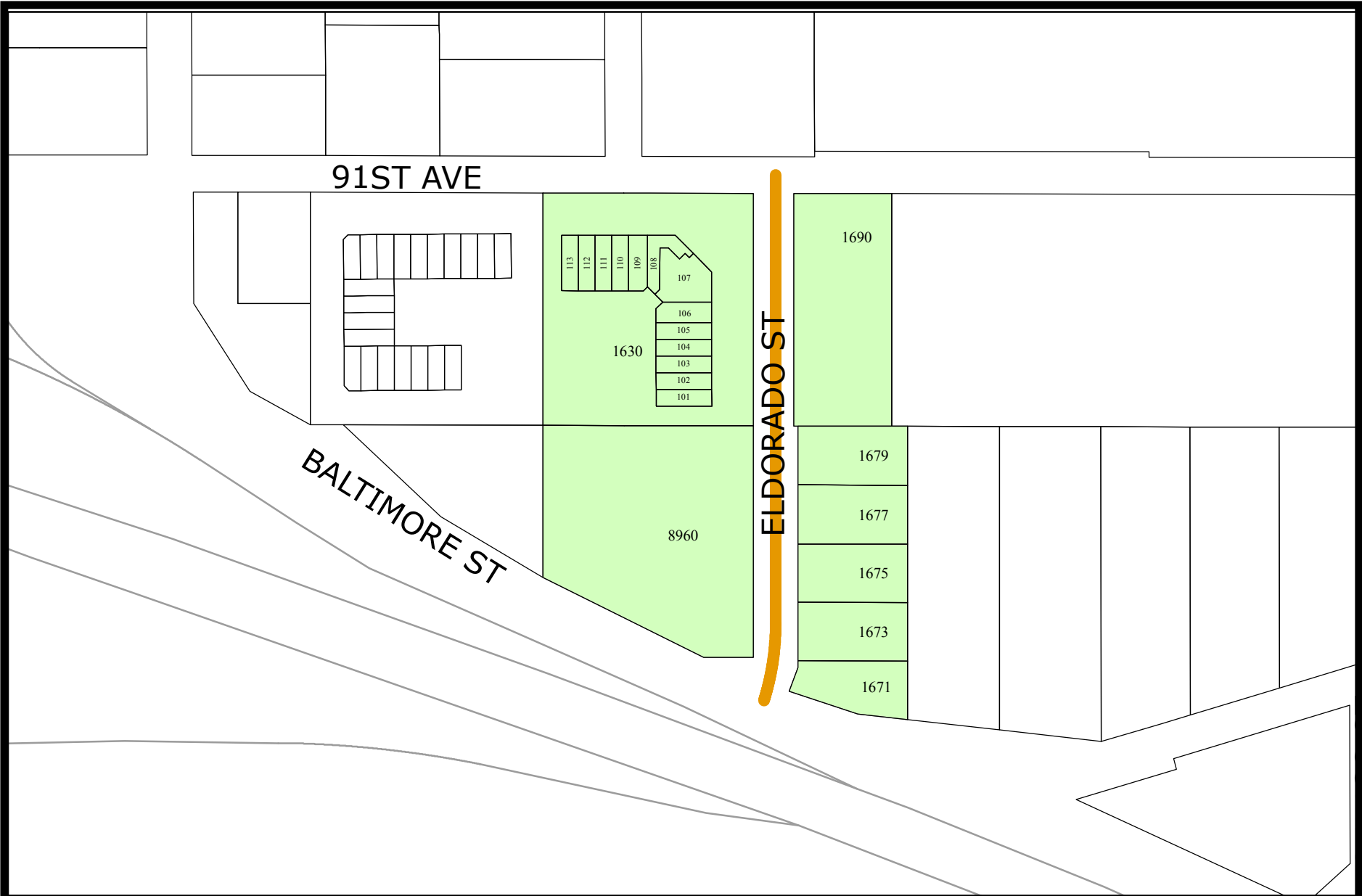
Exhibit 4 Assessment Map Project 13-24